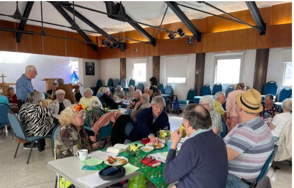
The 'Big Sing' on Saturday 14 May 2022 was enjoyed by all.