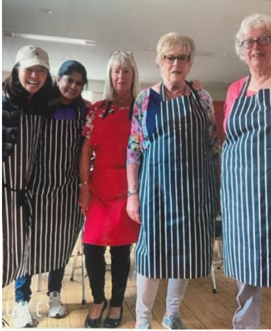
The Community Lunch Team